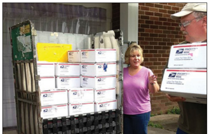
Eastman hosts care package drives to prepare and mail packages to deployed employees and their family members.