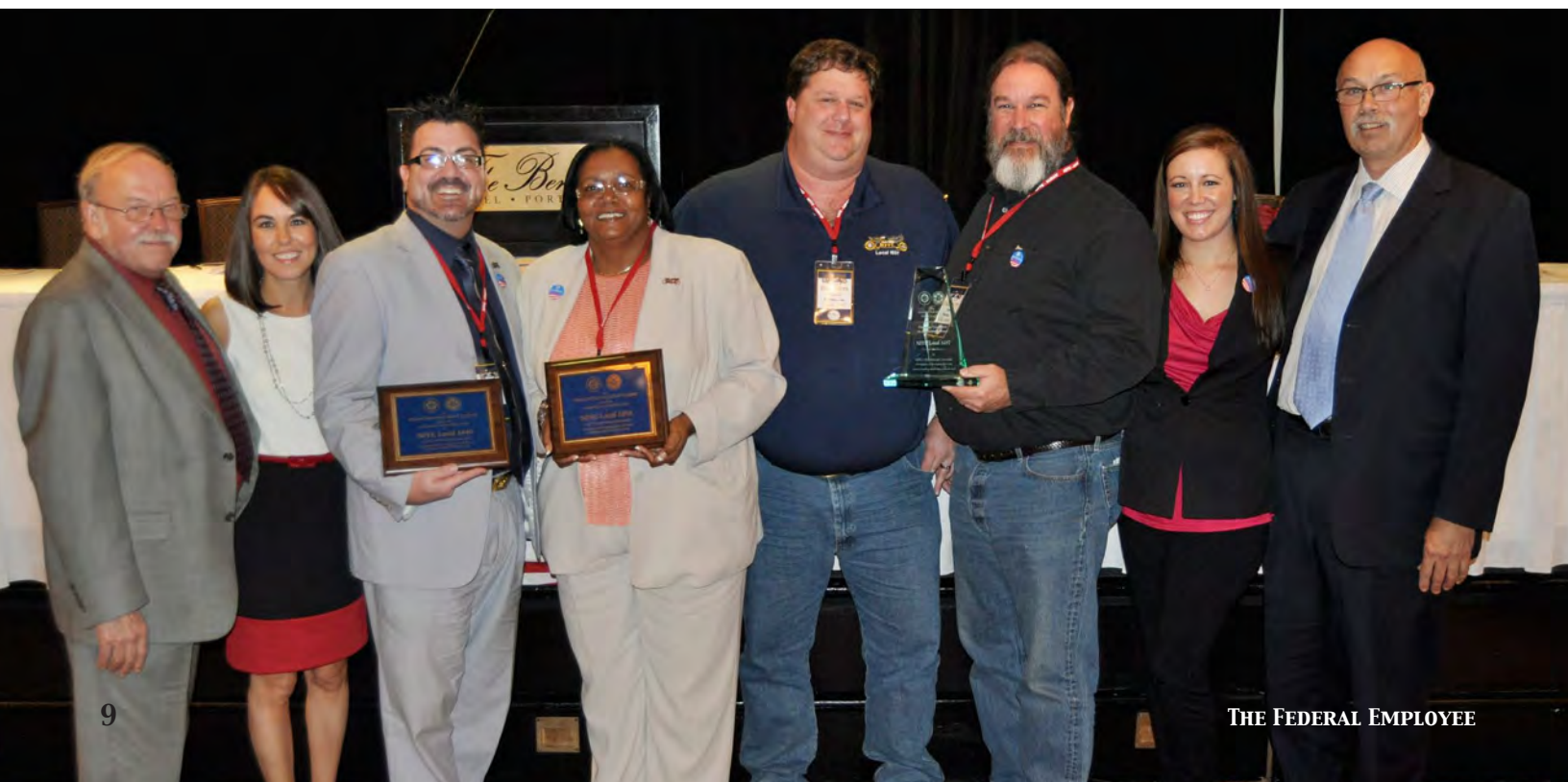
Members of NFFE's Civilian Conservation Corps locals won several awards for their recruitment efforts, including the prestigious "Ongoing Excellence in Recruitment Award."

To determine the remaining award winners, locals were ranked and placed in the appropriate Platinum, Gold, Silver, Bronze and Copper categories, as written in the plan. While the criteria was written to cover a single year, totals were multiplied to determine their four year equivalents. Each local that fell into the Platinum or Gold category that was not already receiving an "Ongoing Excellence in Recruiting" award, were recognized here. The Platinum locals had a density of 50% or greater, and recruited at least 400