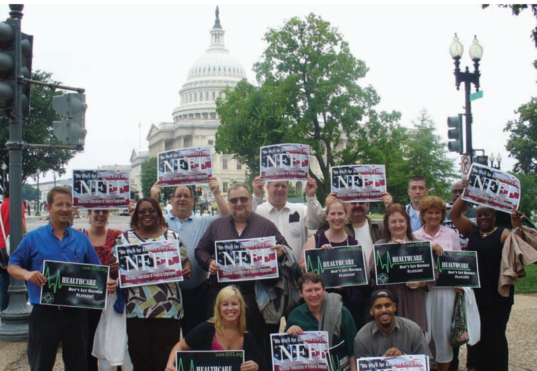
CCC stewards along with NFFE staff rallied for health reform on Capitol Hill.

The week of June 15 th proved to be a very productive one at the NFFE National Office, hosting members of the consolidated Civilian Conservation Corps (CCC) Locals for basic steward training.