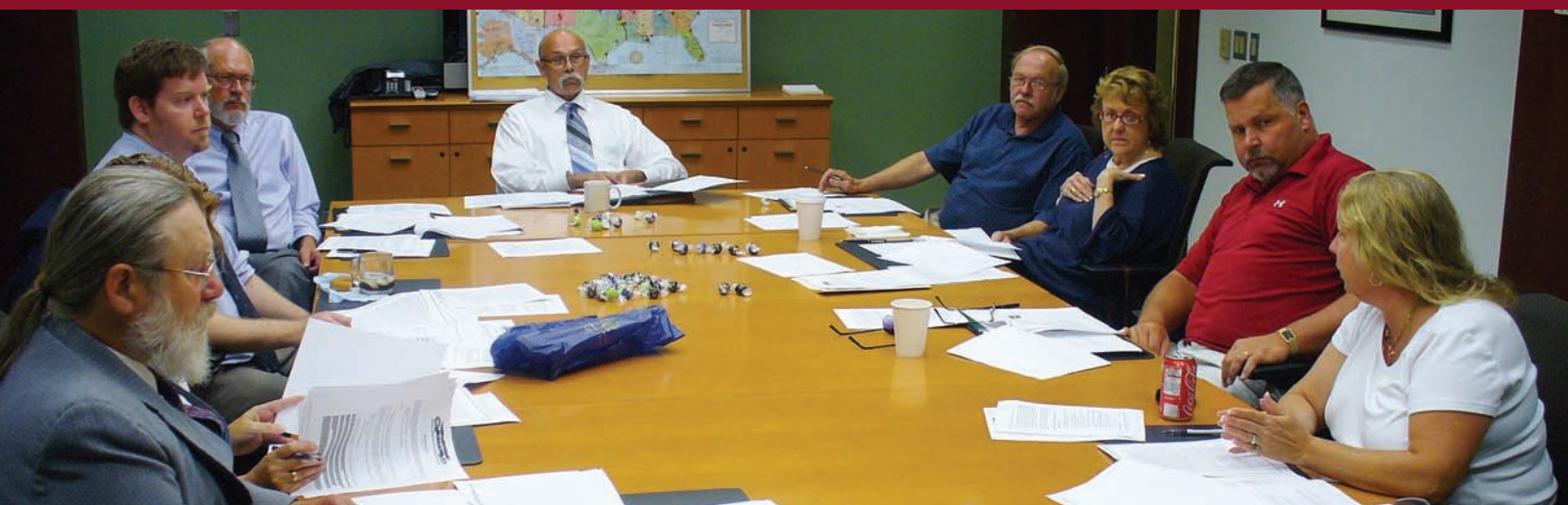
NFFE's National Executive Council gathered at the National Office to review the new Organizing Strategic Plan.