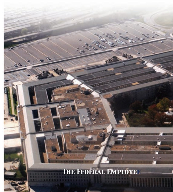
THE FEDERAL EMPLOYEE